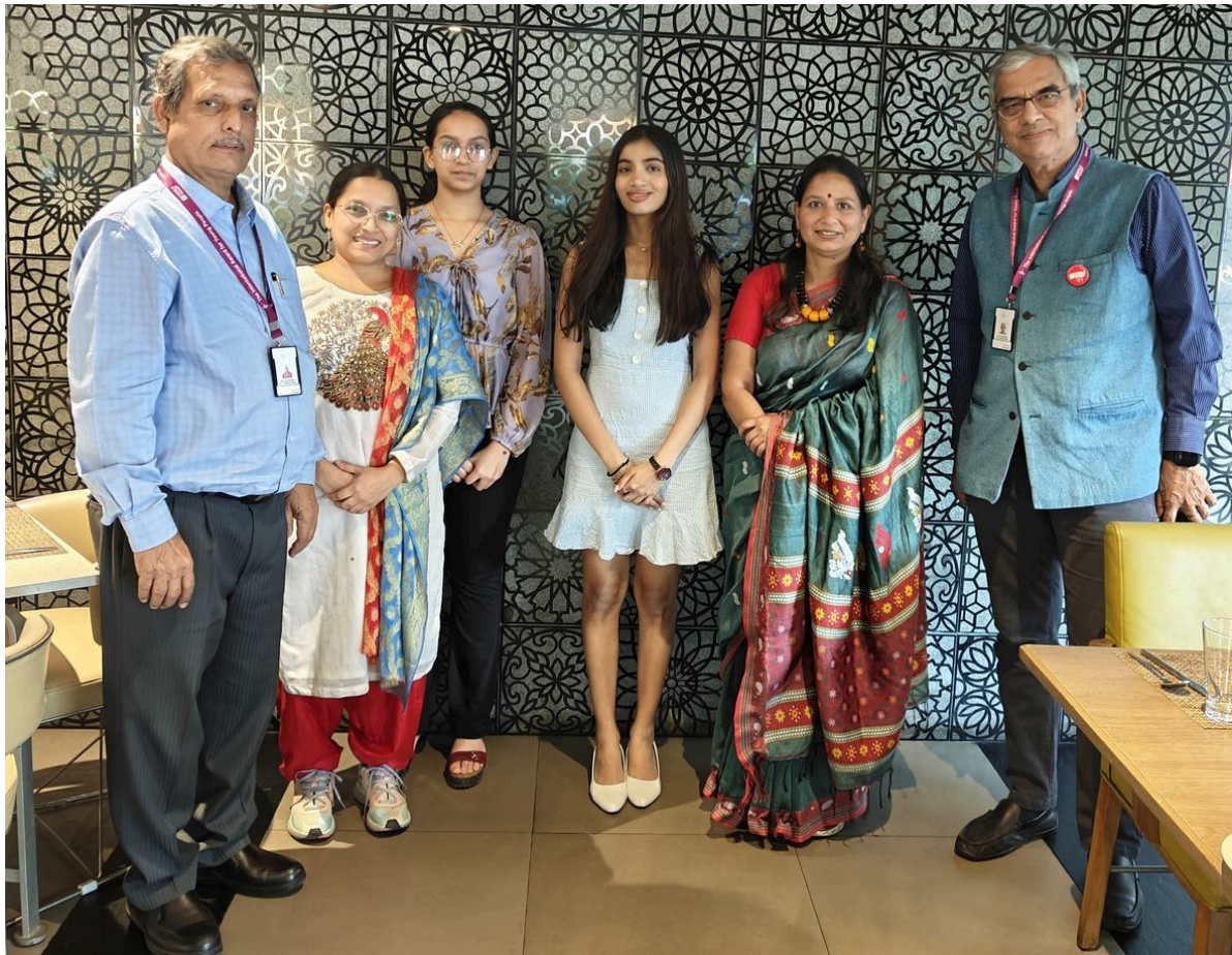
Meeting with the leadership team at Sarala Birla Academy, Bengaluru