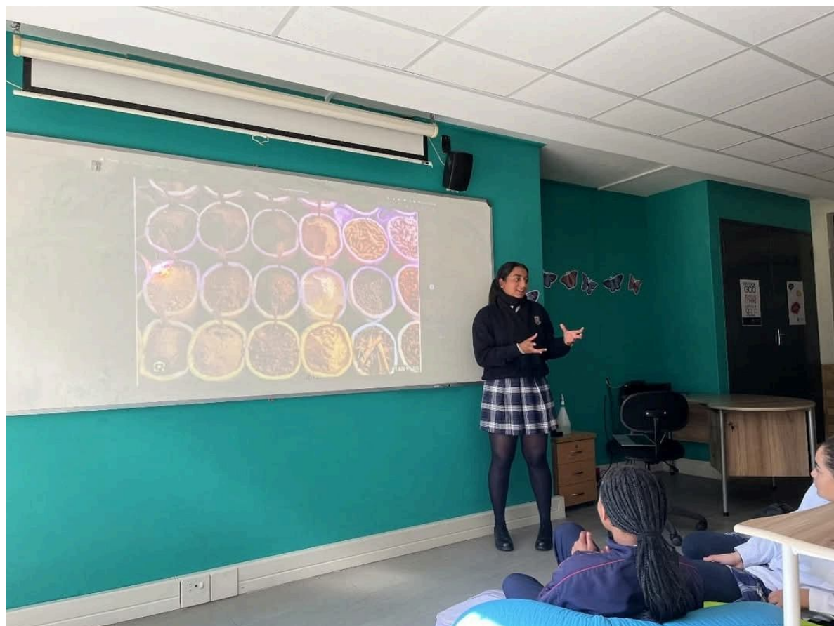
Gold Residential Project (June 2024)