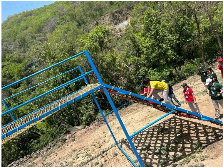
Games Village, New Delhi