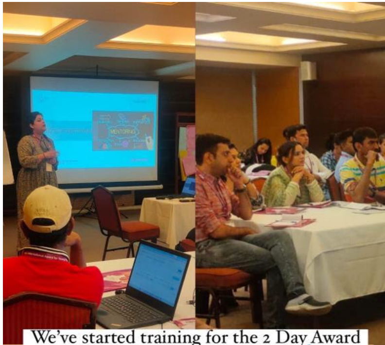
We've started training for the 2 Day Award Leader Training in Mumbai 🚀