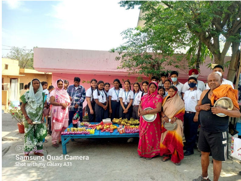
Samsung Quad Camera Shot with my Galaxy A31