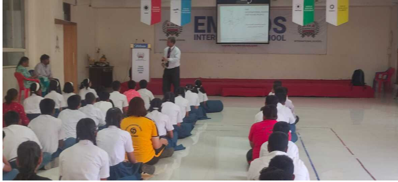
Award Leader Training in Mumbai- 20th and 21st April, 2023