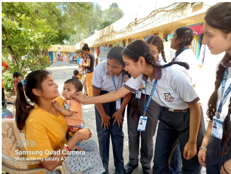
Samsung Quad Camera Shot with my Galaxy A31