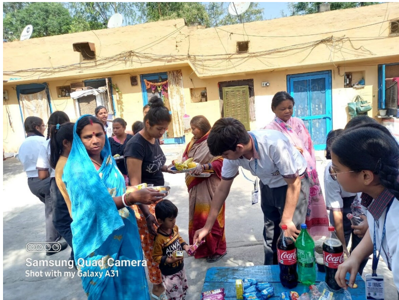
Samsung Quad Camera Shot with my Galaxy A31