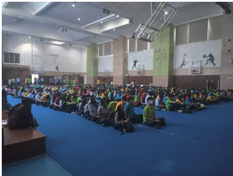
Award Orientation at Vishwakarma International School, Talegaon