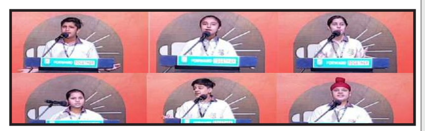
Intra Class English Debate Competition 2022 - Grade VII & VIII