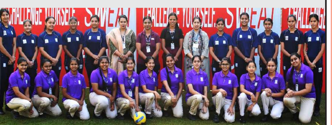
Inter Class Throw Ball Competition 2022 - Grade XI vs XII