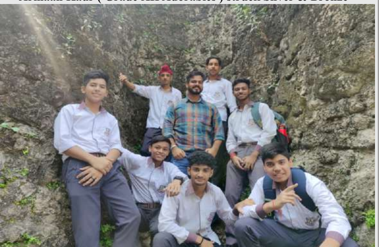
CHANDIGARH TRIP 2022