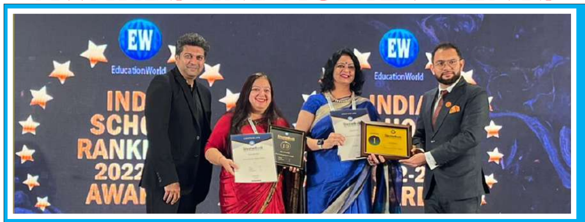
Education World Best School - Excellence in Academics & Social Impact Award - 2022