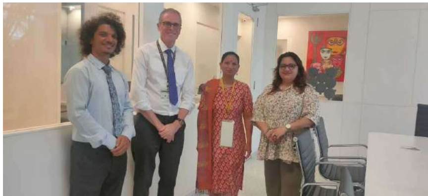
Award Induction Meet at Vishwakarma Empros International School