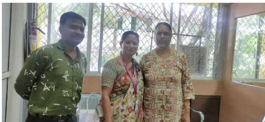
Award Induction Meet at Ascend International School