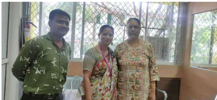
Award Induction Meet at Ascend International School