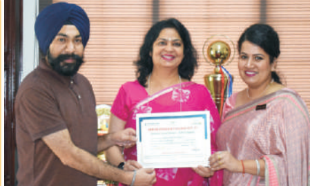
SWACHH VIDYALAYA PURUSKAR 2022