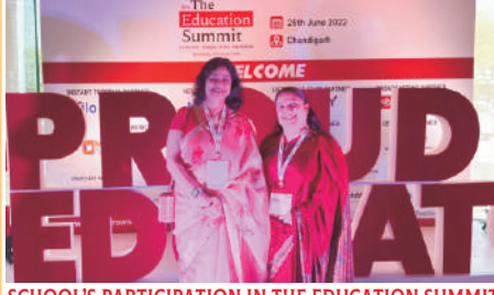
SCHOOL'S PARTICIPATION IN THE EDUCATION SUMMIT