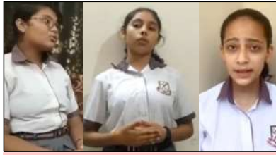
International Day of Democracy