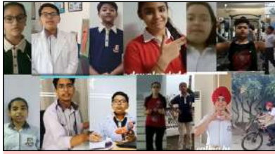
Word Heart Day