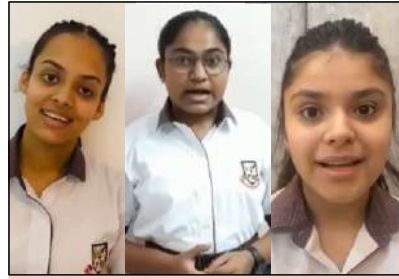
National Nutrition week