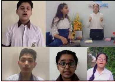
World Tourism Day