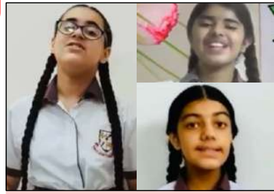
International Day of Peace