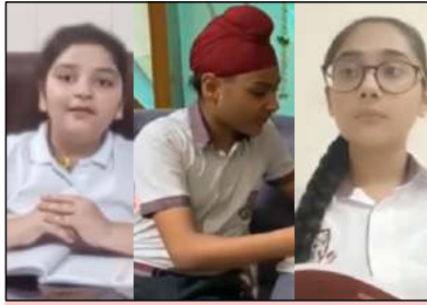
International Literacy Day