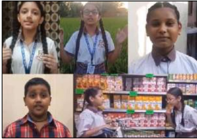
Awareness of Food Loss & Waste