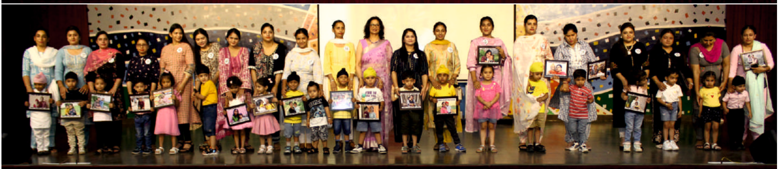
Fresher preschoolers (Form Nursery to Form I) put on an interesting show in celebration of Mother's Day 2024, expressing their love and devotion to mothers through songs, dances and oratory dedications. It was an opportunity to show how much they appreciate their mothers' care.