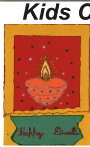
Durva Garg IV-A