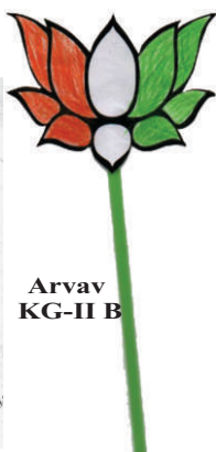
Arvav KG-II B