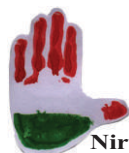
Nirvaan KG-I B