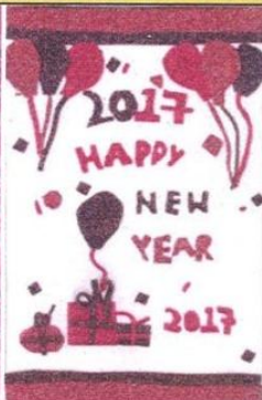
Gurnoor Bawa V-B