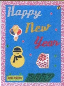
Laksh Sood V-B