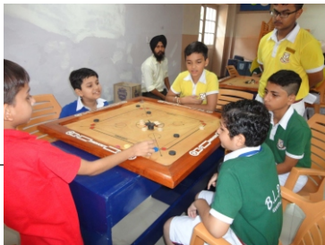
Inter-House Chess And Carrom Competition.