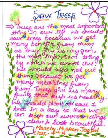
Muskan Jagtap VII-A