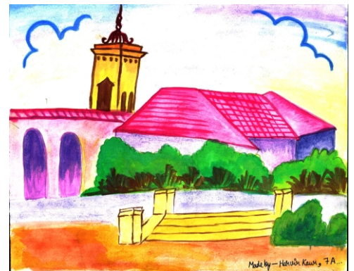
Harvir Kaur VII-A