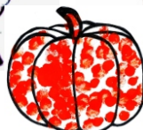
Ranvir KG II-A