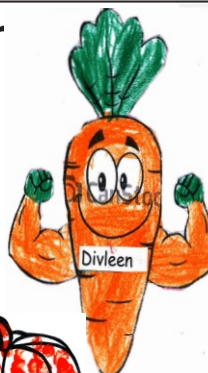
Divleen KG II-B